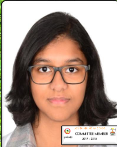
ABU DHABI INDIAN SCHOOL COMMITTEE MEMBER 2017 - 2018