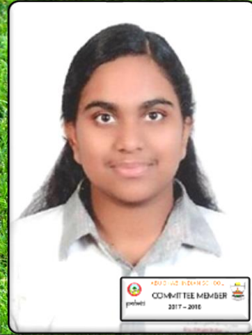
ABU DHABI INDIAN SCHOOL COMMITTEE MEMBER 2017 - 2018