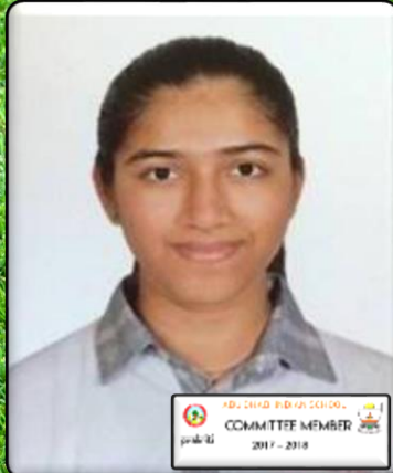
ABU DHABI INDIAN SCHOOL COMMITTEE MEMBER 2017 - 2018