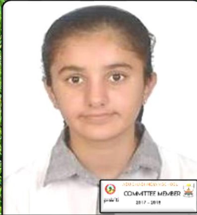
ABU DHABI INDIAN SCHOOL COMMITTEE MEMBER 2017 - 2018