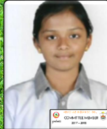
ABU DHABI INDIAN SCHOOL COMMITTEE MEMBER 2017 - 2018