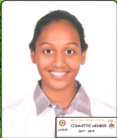
ABU DHABI INDIAN SCHOOL COMMITTEE MEMBER 2017 - 2018