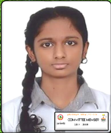
ABU DHABI INDIAN SCHOOL COMMITTEE MEMBER 2017 - 2018