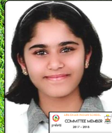
ABU DHABI INDIAN SCHOOL COMMITTEE MEMBER 2017 - 2018