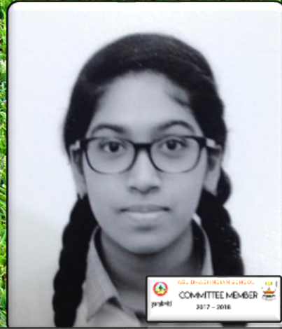
ABU DHABI INDIAN SCHOOL COMMITTEE MEMBER 2017 - 2018